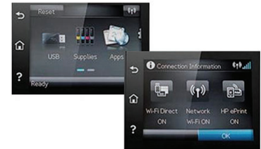
Control panel view