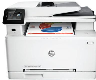
HP Color LaserJet Pro MFP M277dw

You'd never expect this much performance from such a small package. This loaded MFP and Original HP Toner cartridges with JetIntelligence combine to give you the tools you need to get the job done.