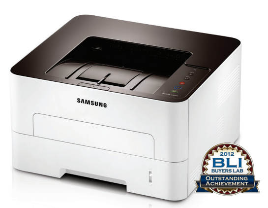
Outstanding Achievement in Innovation: Samsung Easy Eco Driver